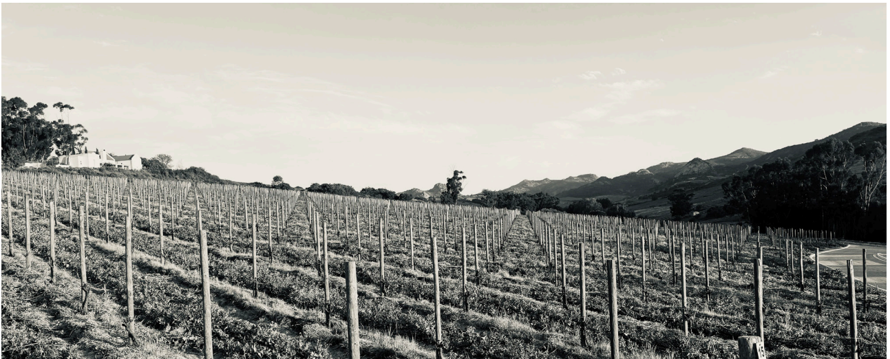
Rolled Cover Crops, Pruned Vines and Spring in Motion.

The 2025 vintage, by and large, is seen as one of the all-time great national vintages; it not only produced the most incredible wines in the Swartland region but also in the Hemel-en-Aarde Valley, Constantia, Stellenbosch, Robertson, and other regions. It goes without fail, and it will become for a long time the measure of any vintage that follows.